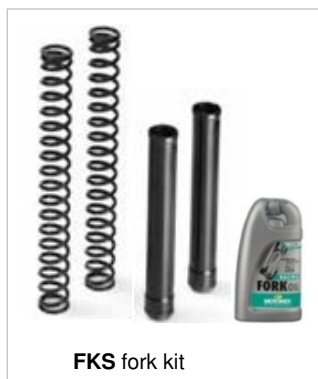
FKS fork kit