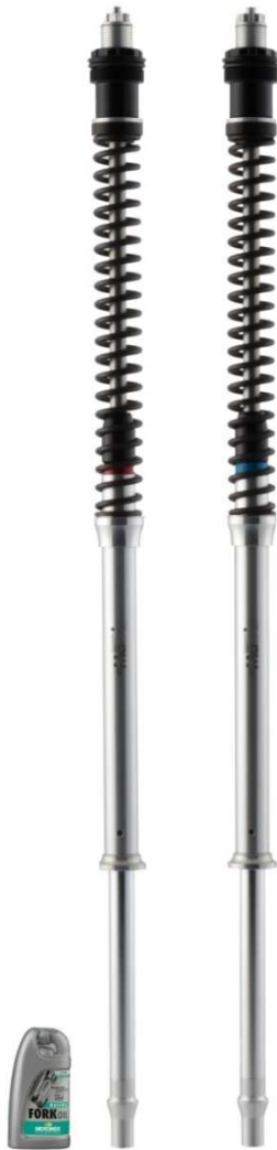
F15K fork kit