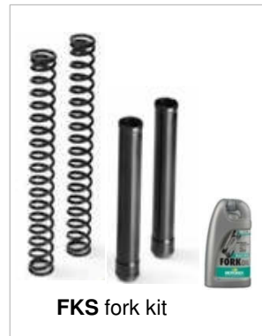
FKS fork kit