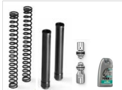
FRK fork kit