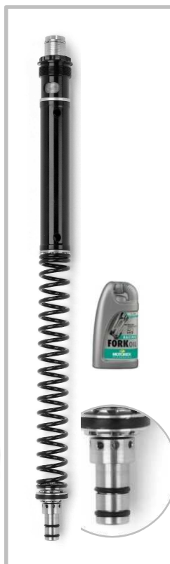
FSE fork kit