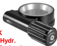
IK Knob-Hydr. Spring Preload