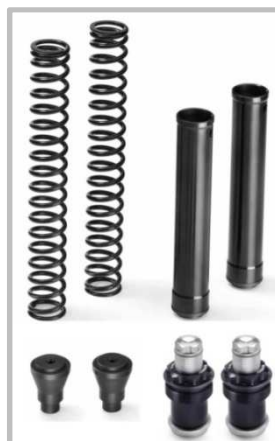
FKE fork kit