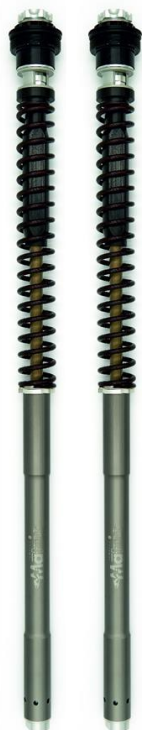
F20K Quad-valve asymmetric system