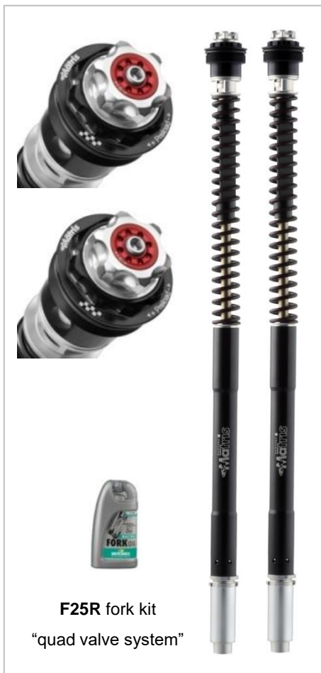
F25R fork kit "quad valve system"