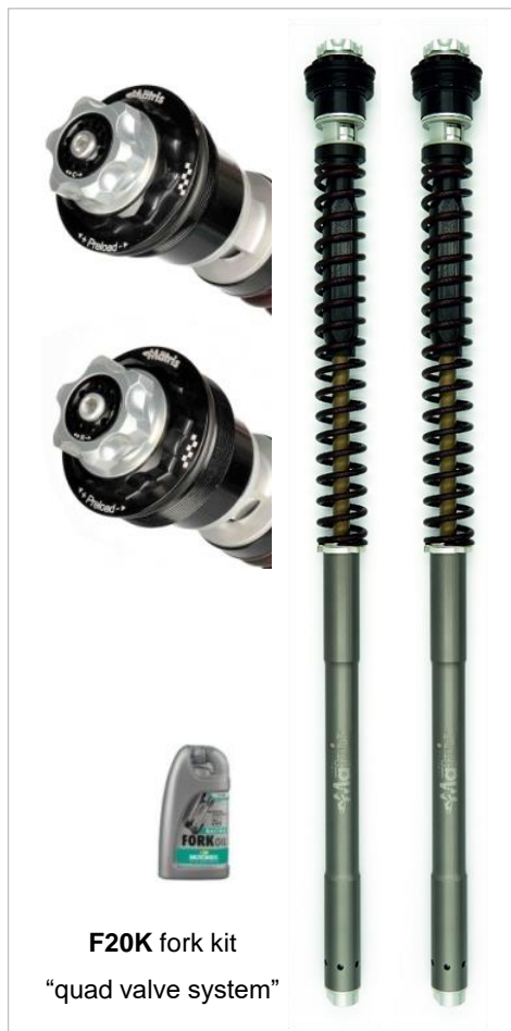
F20K fork kit "quad valve system"