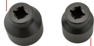
T22 fork cap tool 28 (6 sides)