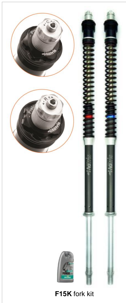
F15K fork kit