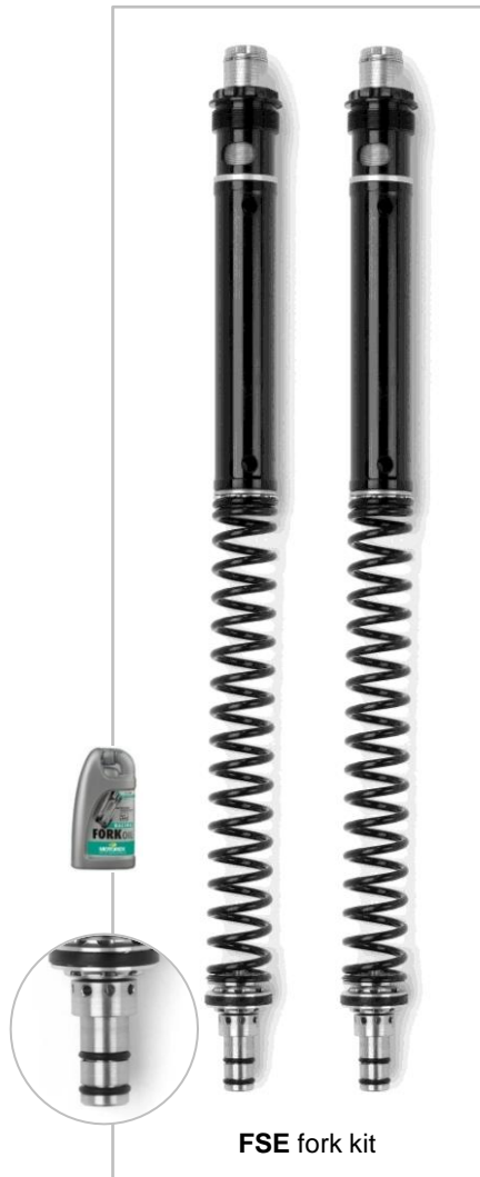
FSE fork kit