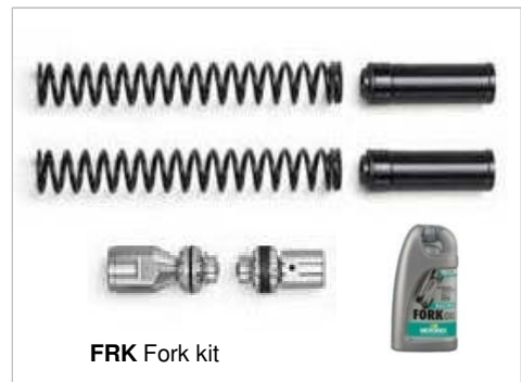
FRK Fork kit