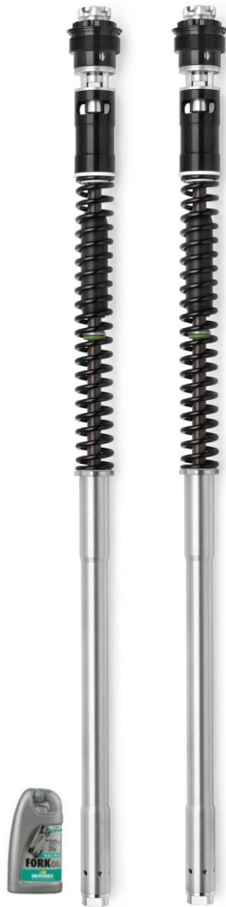
F20K fork kit