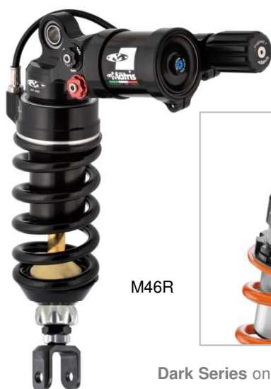
Dark Series on demand

(*) racing use only without start key unit / uso racing senza blocchetto chiave