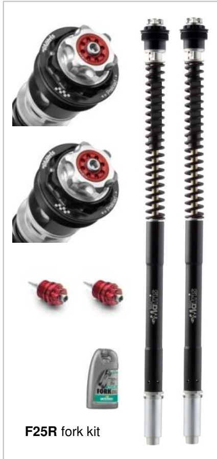
F25R fork kit