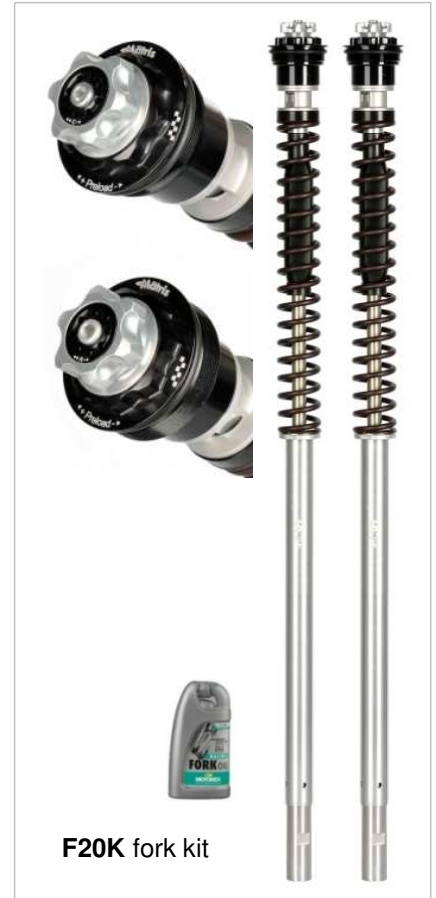
F20K fork kit