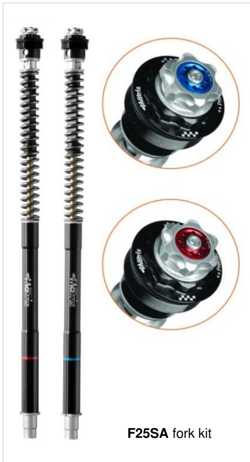
F25SA fork kit