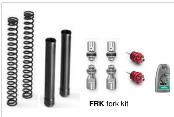
FRK fork kit