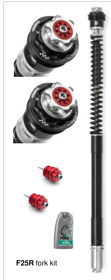
F25R fork kit