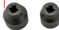
T22 fork cap tool 28 (6 sides)