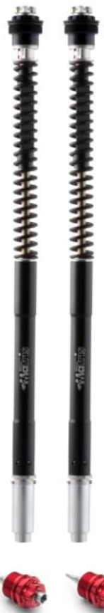
F25R fork kit