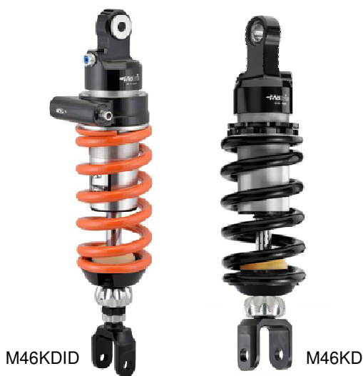
Dark Series on demand

(*) il kit mantiene molle originali / the kit keeps the original spring set