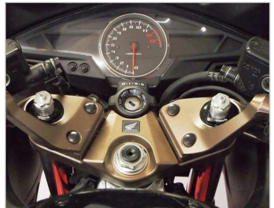
F15K "quad valve system" fork kit