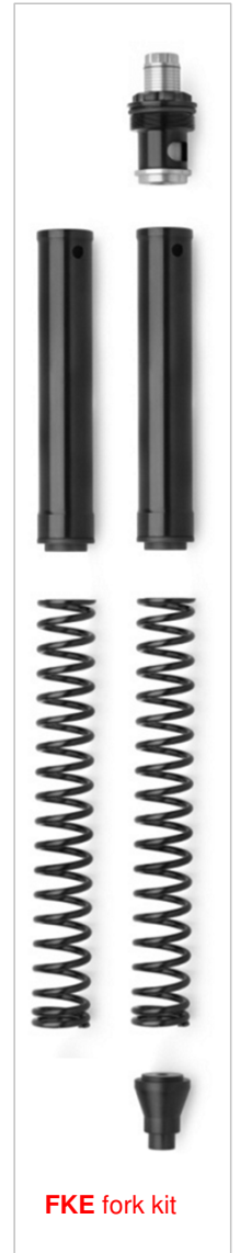
FKE fork kit