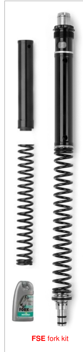
FSE fork kit