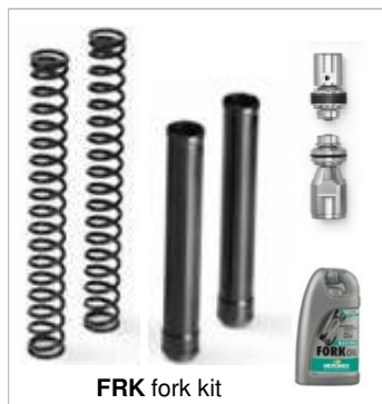
FRK fork kit