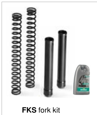
FKS fork kit

on demand the technopolymer fork cap tools