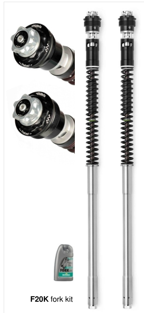
F20K fork kit