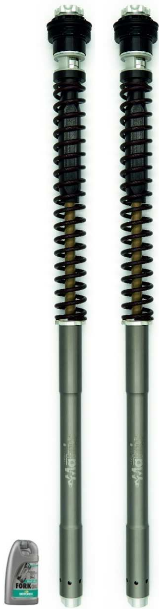
F20K fork kit