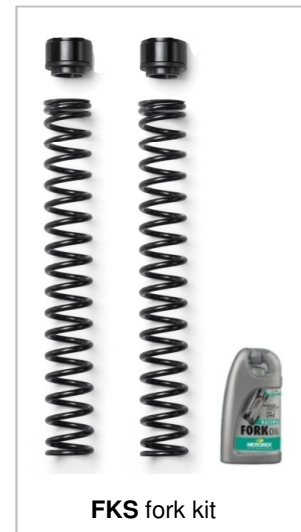
FKS fork kit