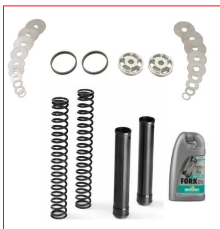
FRK fork kit

C = compression adj. / regolaz. Compressione R = rebound adj. / regolaz. estensione L = length adj. / regolaz. Interasse P = std spring preload / precarico molla std HP = hydraulic spring preload adj. / precarico molla idraulico