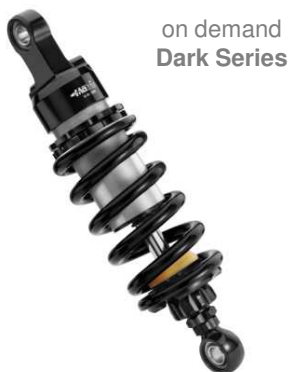
on demand Dark Series