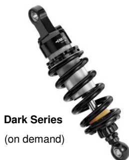
Dark Series (on demand)