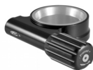
IK Knob-Hydraulic Spring Preload