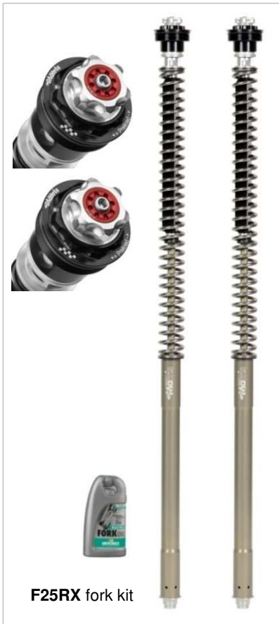
F25RX fork kit