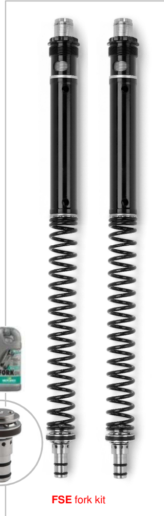
FSE fork kit