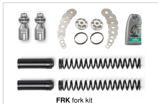
FRK fork kit