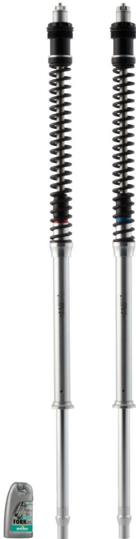
F15K fork kit