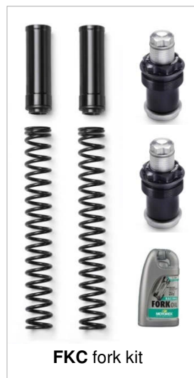
FKC fork kit