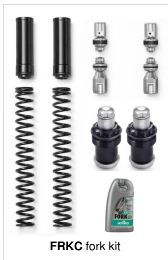
FRKC fork kit