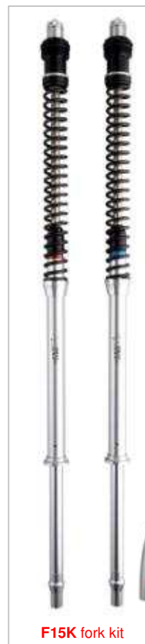
F15K fork kit

C = Compression adj.ustment / regolazione Compressione R = Rebound adj.ustment / regolazione Estensione P = standard spring Preload / Precarico molla standard