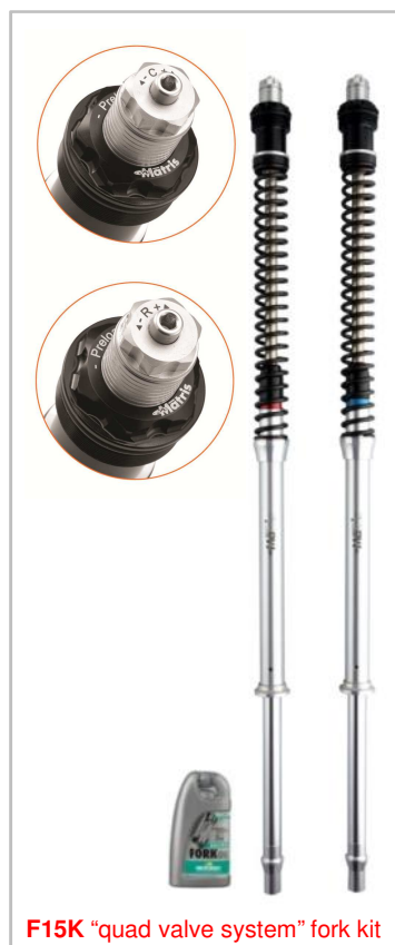
F15K "quad valve system" fork kit