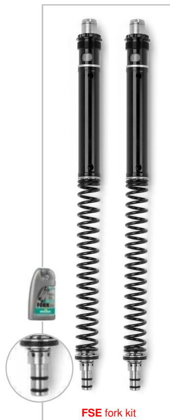
FSE fork kit