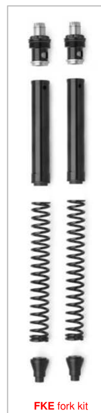
FKE fork kit