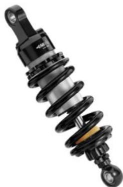
on demand Dark Series