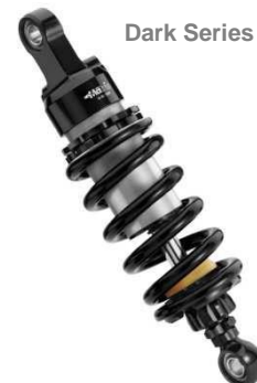
Dark Series (on demand)

CH = HighSpeed Comp. adj. / regolaz. Compres. AV CL = LowSpeed Comp. adj. / regolaz. Compres. BV C = Compression adj. / regolaz. Compressione R = Rrebound adj. / regolaz. estensione L = Length adj. / regolaz. Interasse P = std spring Preload / precarico molla standard HP = hydraulic spring Preload adj. / Precarico molla idraulico