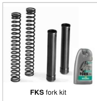
FKS fork kit

on demand the technopolymer fork cap tools