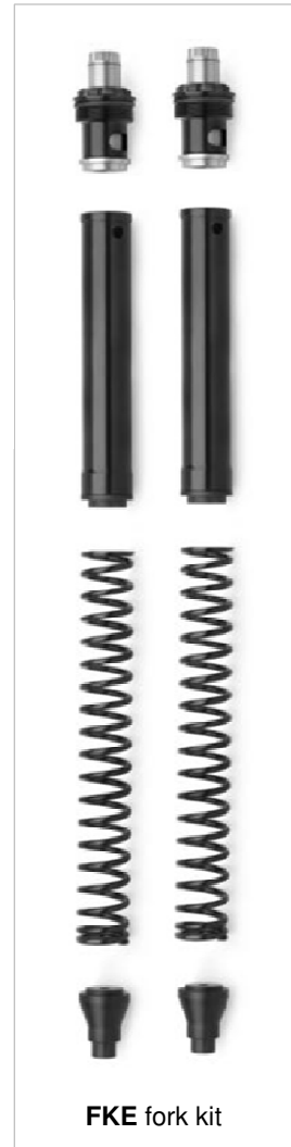
FKE fork kit