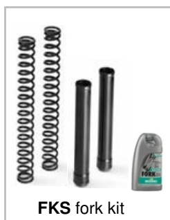
FKS fork kit