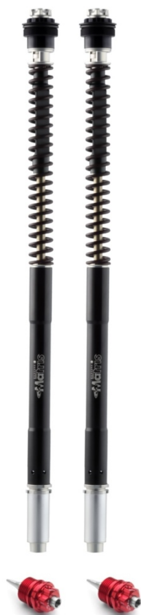
F25R fork kit