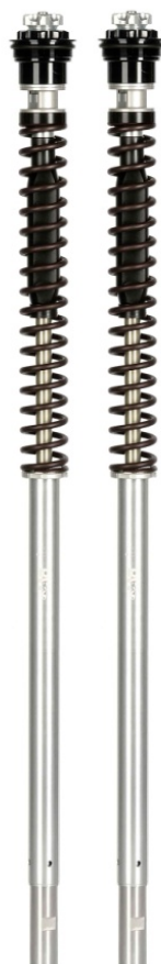
F20K fork kit