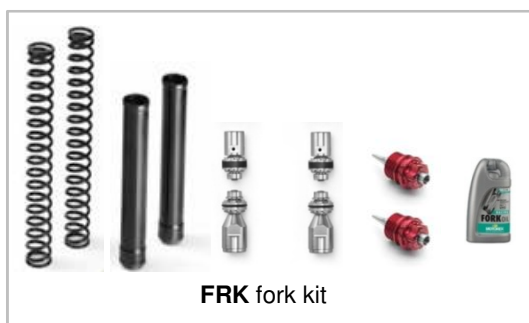
FRK fork kit