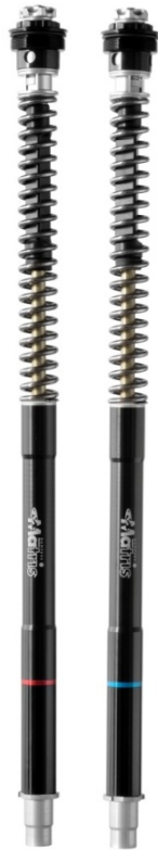
F25SA fork kit