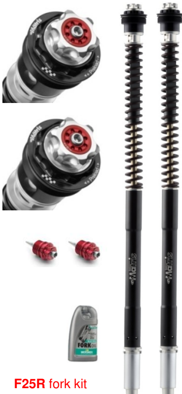
F25R fork kit