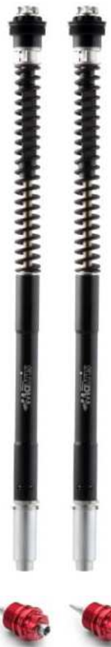
F25R fork kit