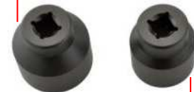
T22 fork cap tool 28 (6 sides)