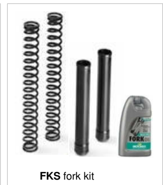
FKS fork kit