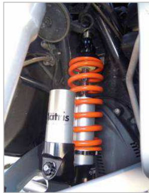
on demand Dark Series