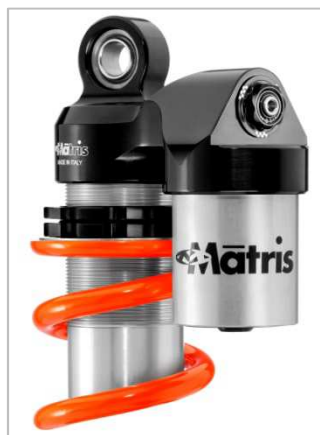
rear / posteriore M46K (adjustment: C–R–L–HP)