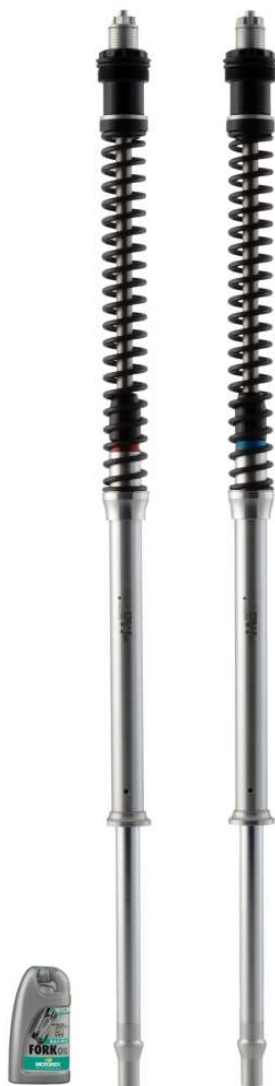
F15K "quad valve system" fork kit